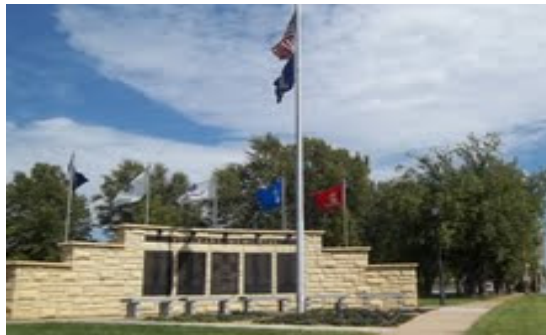
Colwich Veterans Memorial

Our quarterly Board of Directors meetings, held at locations along the corridor, include informative presentations, reports on our activities and news from our members, business and industry tours.. We'll even provide tasty food from local restaurants and a great opportunity to network! Plan on Attending our next meeting.